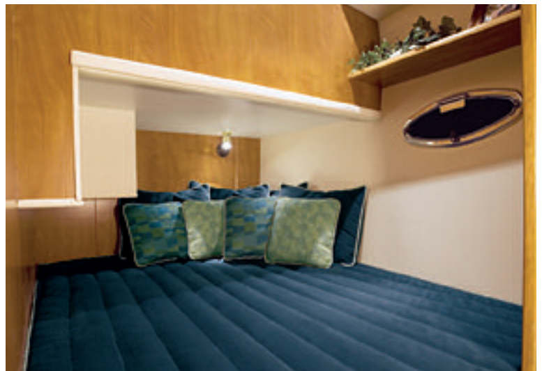
Our entry-level Convertible, the 33C features a second stateroom with double berth, hanging locker, and standup changing area – rare in this size range. These features are coupled with a forward master and a roomy galley-up salon to provide the feel of a larger boat.